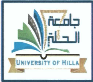
Hilla University - Iraq

The Ministry of Higher Education and Scientific Research, Republic of Iraq